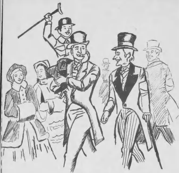
"God Bless Us, Every One!"

"Pascu ta bini solamente un vez pa anja desafortunadamente un gran berdad Pasobra dia cu e cuminza keda cu nos durante henter anja Lo nos haci mundo bira un lugar completamente diferente."